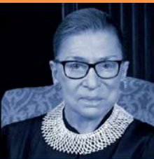
Ruth Bader Ginsburg